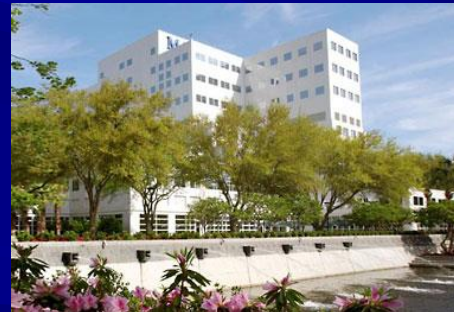
Mayo Clinic - Jax